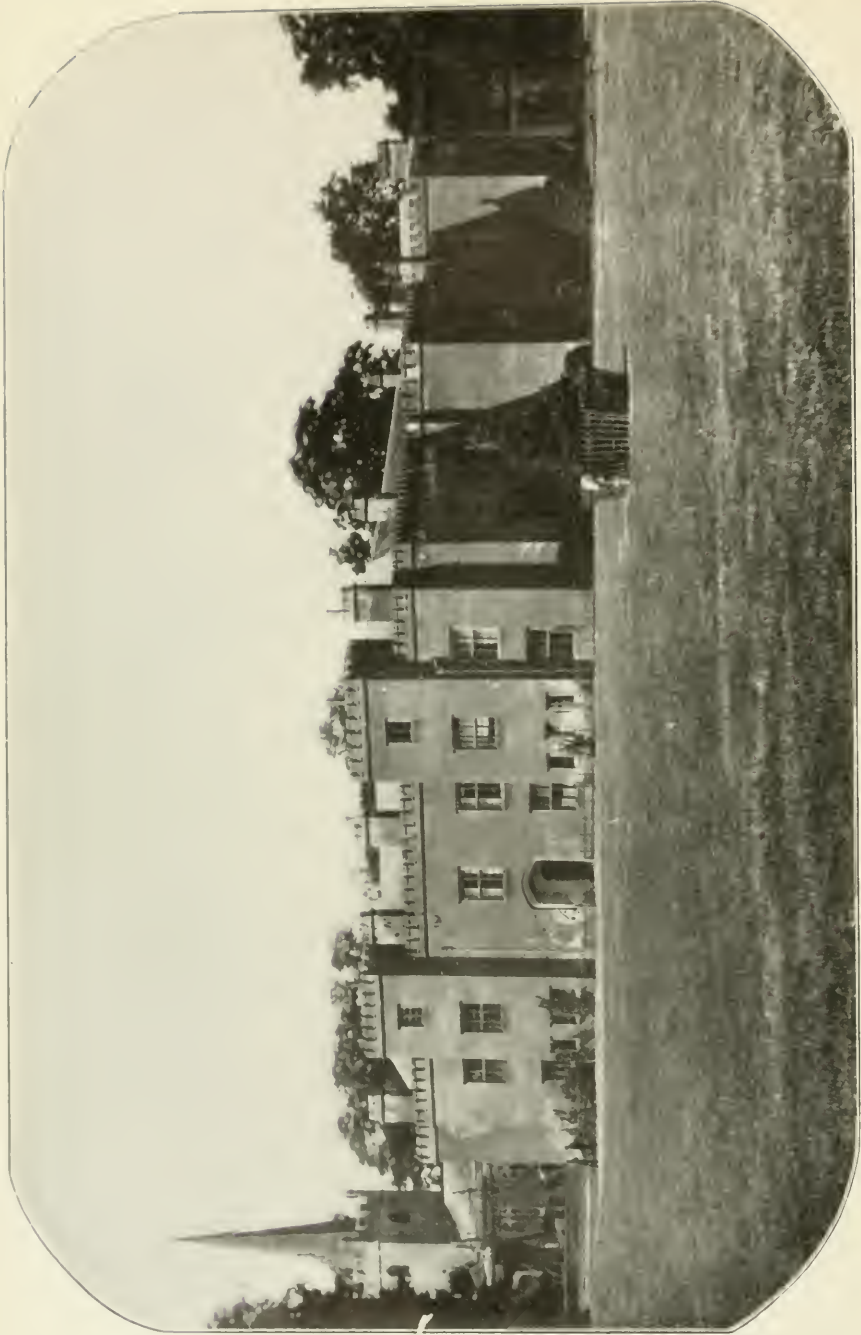
HOLME-PIERREPONT. NOTTINGHAMSHIRE, ENGLAND.